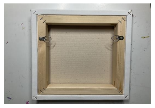
C. Screw the D-rings on painting or your frame.