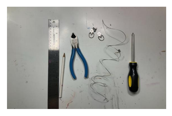
A. You will need: ruler, hanging wire, (2) D-rings (or triangle rings), (2) screws, screw driver, pencil and wire cutters.