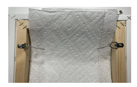
H. Do the same on the other side and clip off any excess wire.