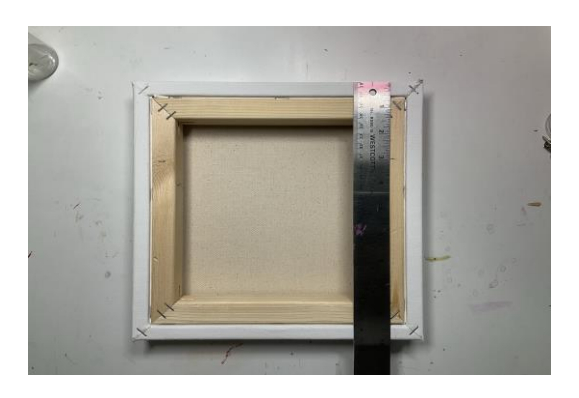
B. Measure a third of the way down. Mark it with your pencil on both sides.