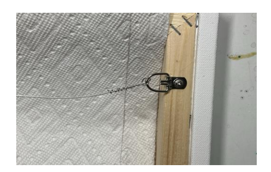
G. Pull the wire tight so the loop fits snuggly up to the D-ring. Wrap the wire. This is called a framer's knot.