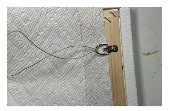
E. Pull wire through both D-rings so that the wire goes through the back and up through the ring