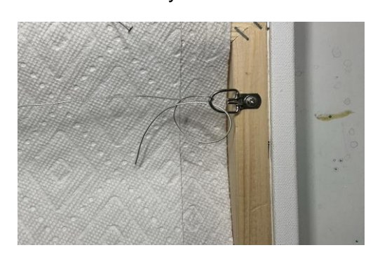
F. The short end of the wire comes through the D-ring and around the back of the wire, back through the top of the D-ring and out the back.